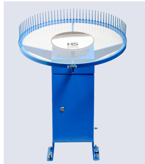
HailSens: Real-Time Hail Measurement Sensor