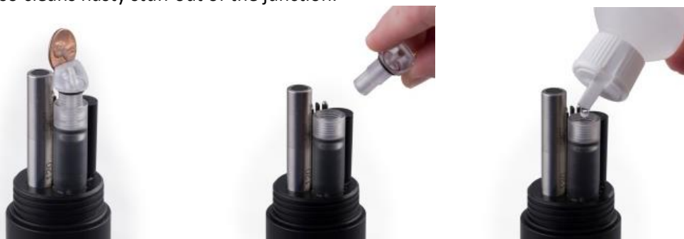
Figure 4 – Filling in fresh pH reference electrolyte