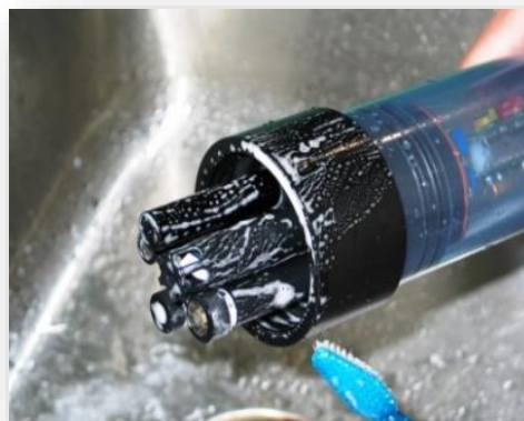
Figure 2 – Rinsing a HyQual multiprobe

Clean your instrument periodically with warm soapy water - liquid dishwashing soap is fine. Do not use abrasives or strong solvents (such as acetone). Do not clean with gasoline, kerosene, or industrial cleaners. Mild household cleaners work well. You can clean sensor stems with a soft brush, but use only a rag or paper towel when cleaning the sensor's actual measurement surface.