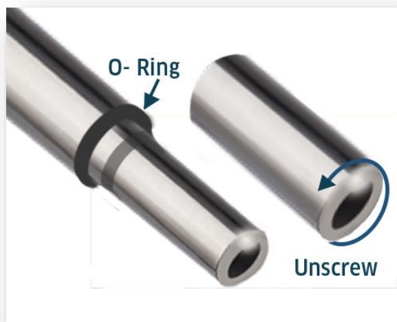
Figure 3 – Getting access to O-Rings

Always remove batteries (if any) and clean The HyQual probe prior to storing it for prolonged periods. Always refill the reference electrode and recalibrate after long storage periods.